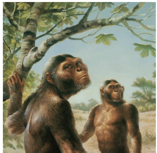
Lucy ( Australopithecus afarensis ) had a much smaller cranial capacity than the average human has today.

Our large brains do come at a cost. Human brains use up about 20% of our daily energy for our entire bodies, even though the brain only accounts for 2% of our body mass. We have use our intelligence to get food to feed our brains!