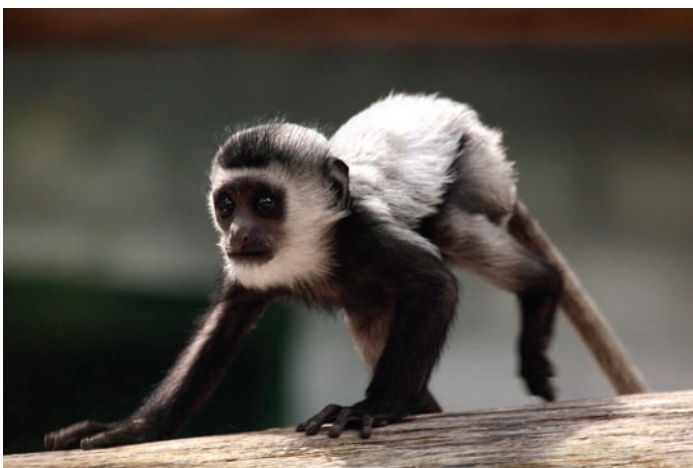
Colobus monkeys have a very small thumb, making it easier for them to swing in trees.

Many millions of years ago, the ancestor to all living primates developed an opposable digit on its hands and feet, which allowed it to cling to branches in the trees where it lived. This trait became beneficial to survival and was passed to all the descendants of that ancestor species.