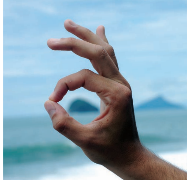
Humans can touch all four fingers with our thumbs.

Our closest living relatives, chimpanzees, have hands that are similar to ours. Their hands allow them to use some simple tools, like using a stick to get ants out of anthills. But they don't have a brain like ours, so they can't plan out complex tools to produce, and they don't improve on the design of their tools over time.